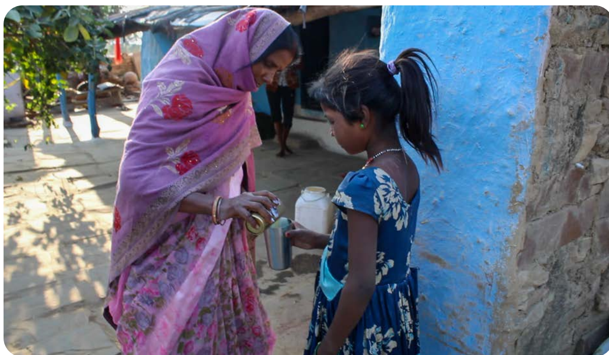
A young girl buys milk for her TB-diagnosed aunt in Umravan village, Panna

In multiple cases, caregivers are also the sole breadwinners of the family and hence they face the double brunt of household work and going out for wage labour, irrespective of their own health condition. For the women, even these household tasks have be-