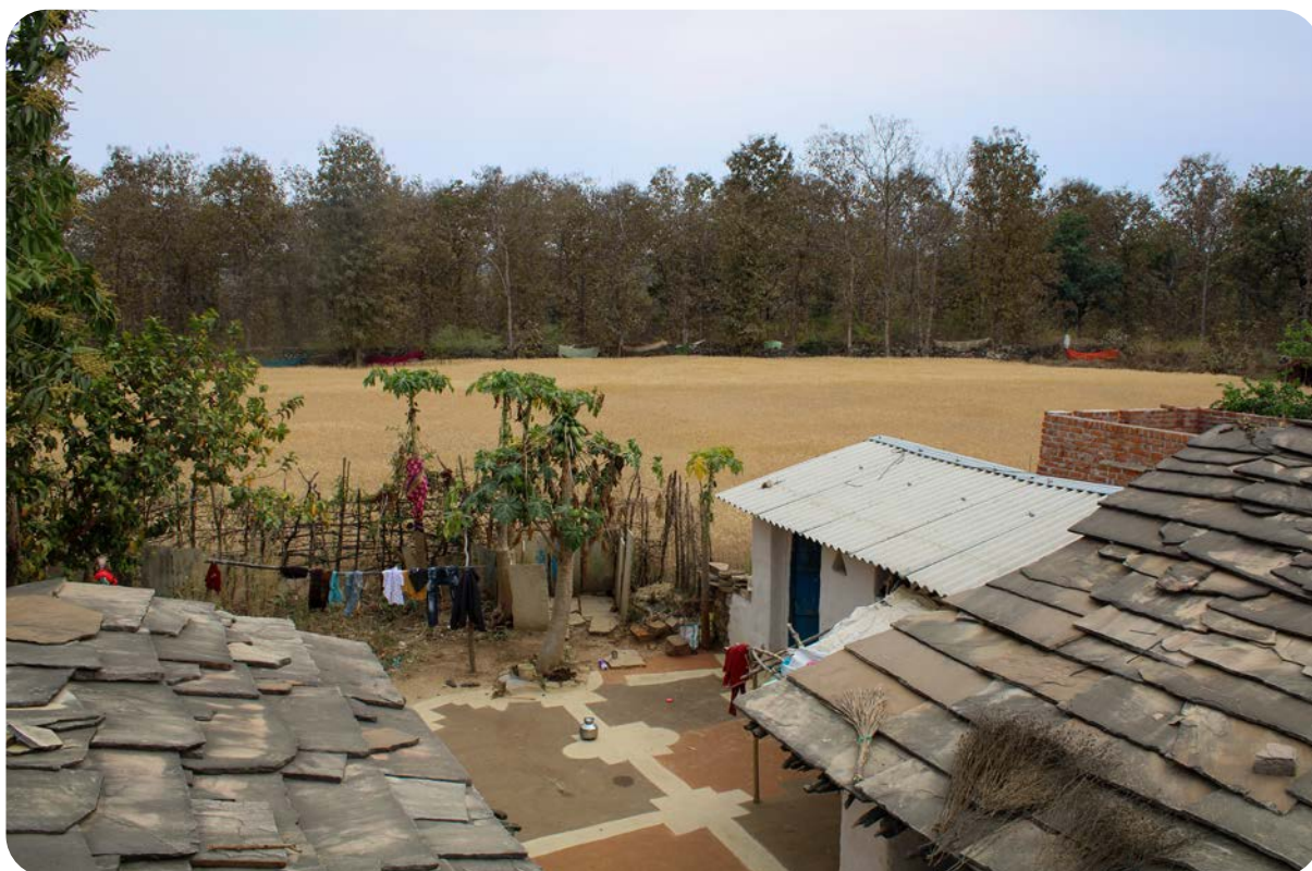
Kaimasan village. Beyond the field (the cluster of trees in the background) is the core area of the tiger reserve.

Kaimasan village is on the border of the PTR core area and the NMDC mining, with just a wall separating the village, where many families lost their agricultural land. As they do not have pattas for these forest lands eligible under the FRA, they did not get any compensation for the land lost. There are two mohallas both together having 82 families of Nand