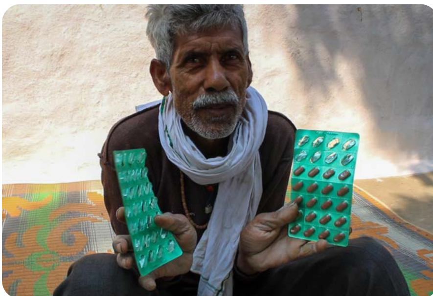
A TB patient from Madaiyan with his medicines