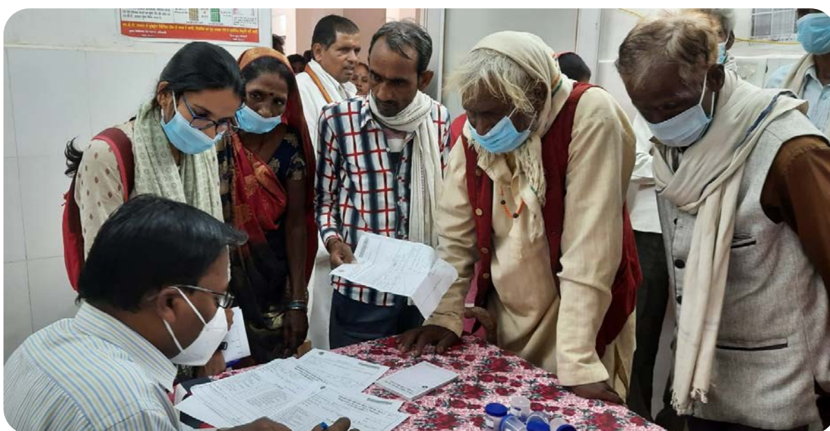
Our team assisting patients at the government health centre

Further, the context in which they survive is a complex socio-political dynamics of conservation, extractivism, tourism and other commercial growth models which do not take into account women's own growth, traditional knowledge practices, customary wisdom and ecological capabilities. They have to survive with multi-dimensional challenges of not having enough agricultural land, unable to forage in the forest both due to restrictions and the fear of tiger attacks, negotiating with mine owners, non tribals, forest guards, tourists, traders, local liquor cartels, unresponsive medical and administrative