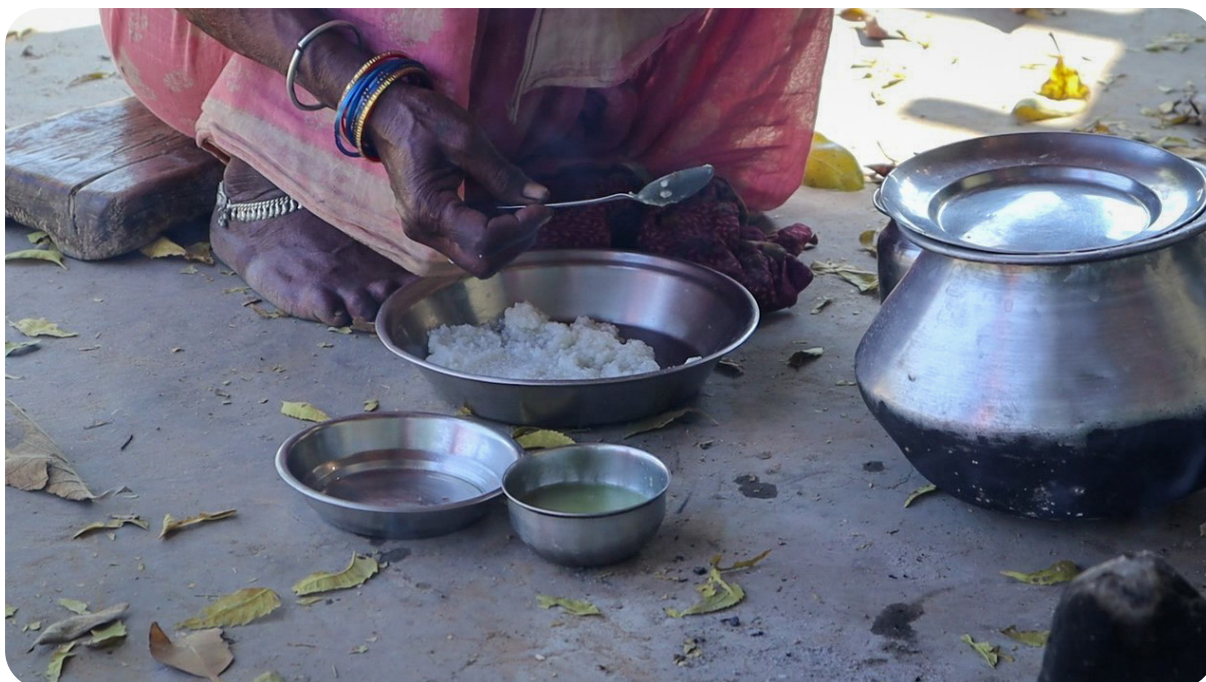
A typical afternoon meal of rice and watery dal at a TB patient's home

of them are mentally tense about their family's health and financial situation, especially the pressure they face from money lenders. They mentioned being physically and mentally exhausted and a sense of hopelessness about the situation at home. These women are also worried and anxious when family members are not finding work or not able to buy food due to inflation in prices. None complained too much about care work as a burden. As one woman put it, 'even a day is less for the amount of work I am supposed to finish'. Getting support from extended family and neighbours in terms of food or money was mixed since some mentioned getting support while others were not so lucky as almost all the Gond families are in a similar situation.