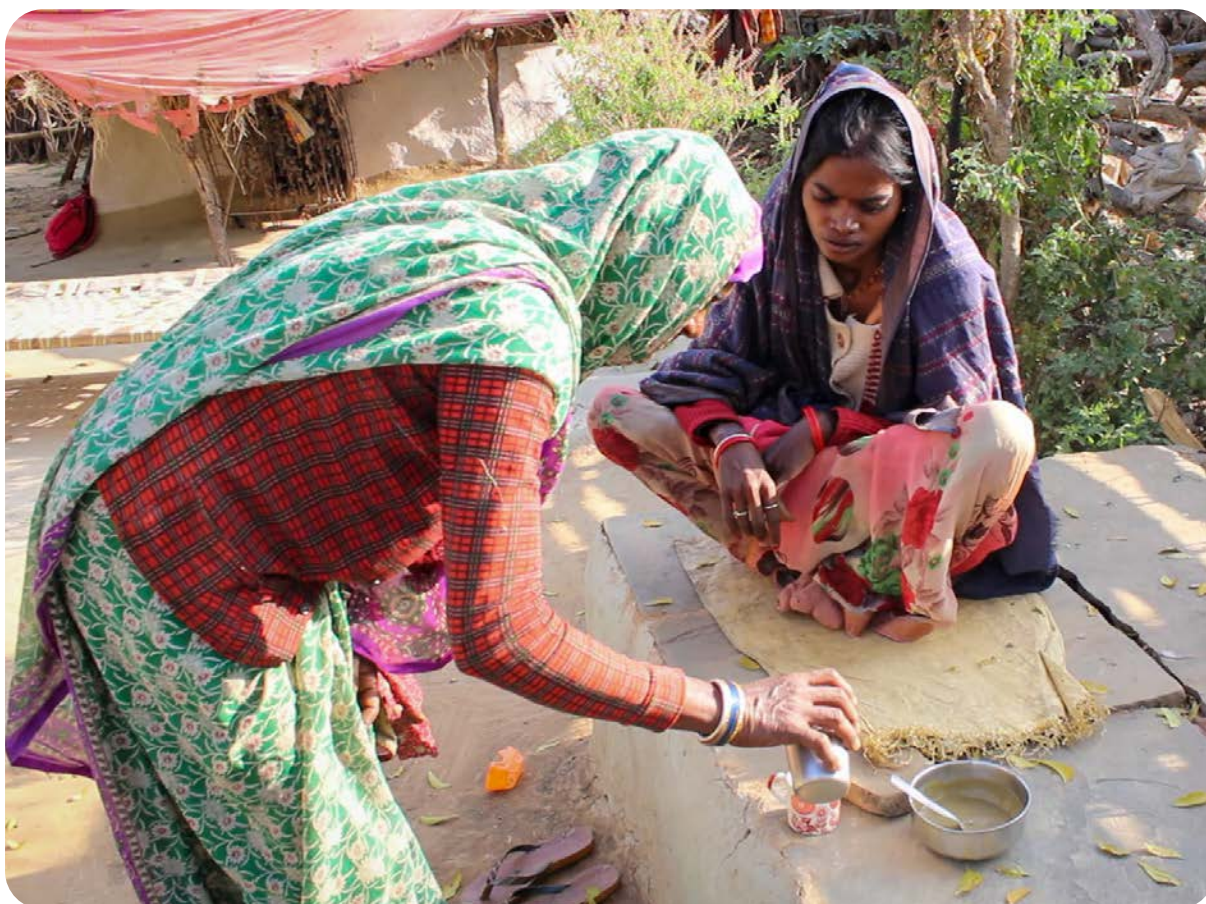
A woman serves food to her TB-diagnosed daughter in Umravan village, Panna

Further, lack of due diligence in the delivery of institutional obligations of rehabilitation after eviction from the Panna Tiger Reserve, has led to mass seasonal migration through intergenerational cycles of hazardous mine labour. Majority of Gond families have worked or are still working as informal mine labour seasonally, with no occupational safety measures or even a registered