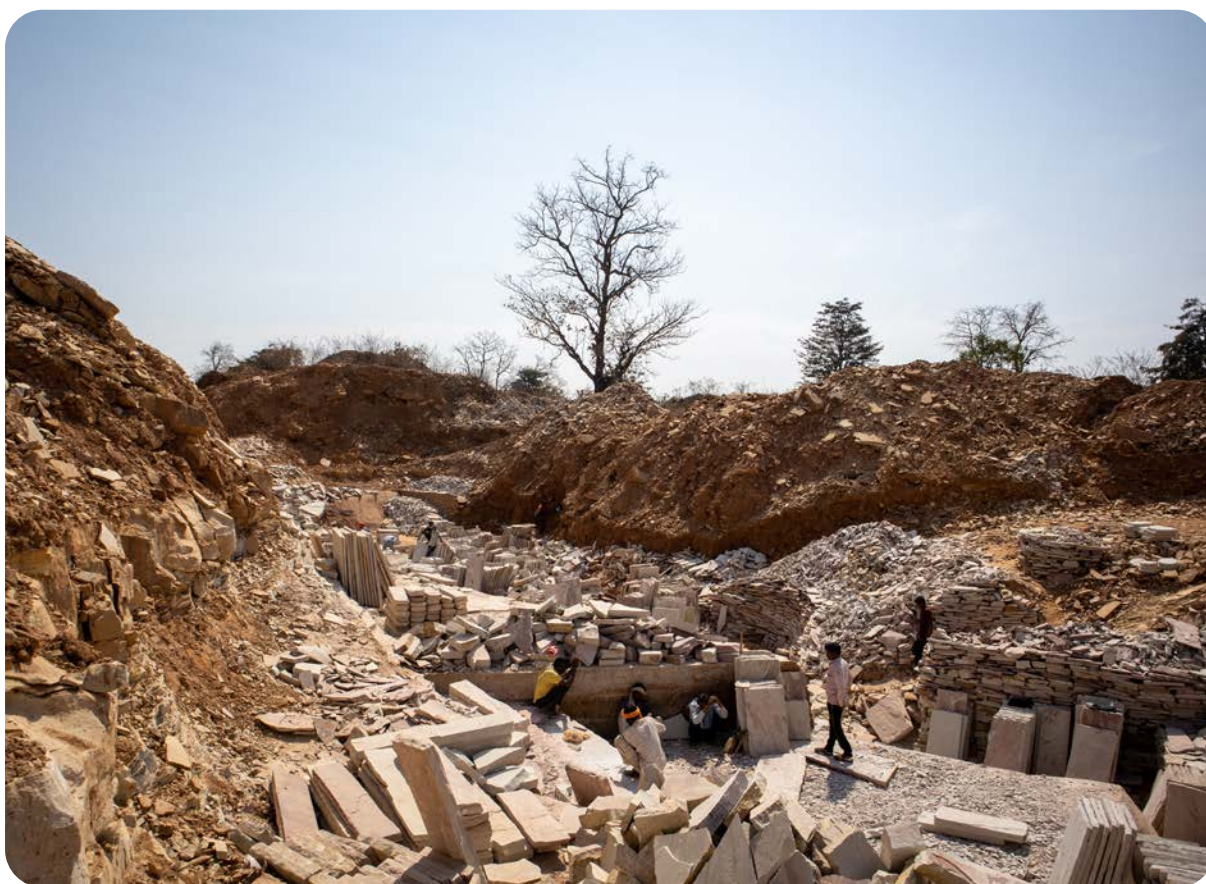
A stone mine in Panna district

Gender disaggregated and age disaggregated data of informal mine workers has to be collected regularly by the labour department and put in the public domain. The mines and labour departments have to implement