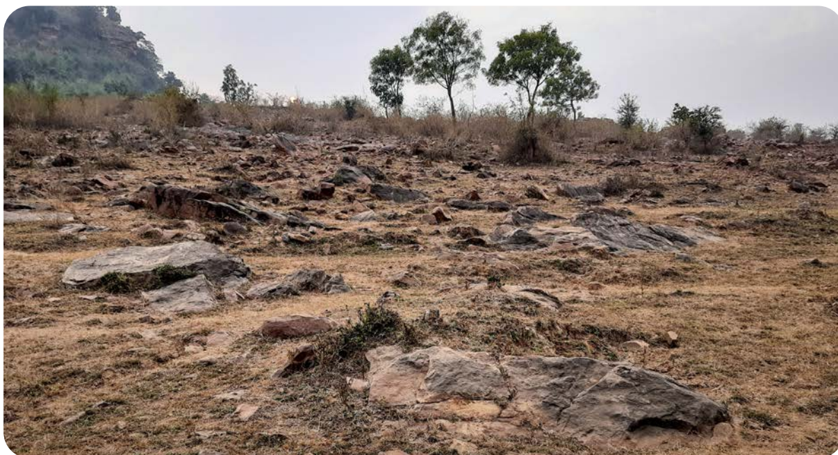
A rocky and unlevelled plot of land received by a family after relocation