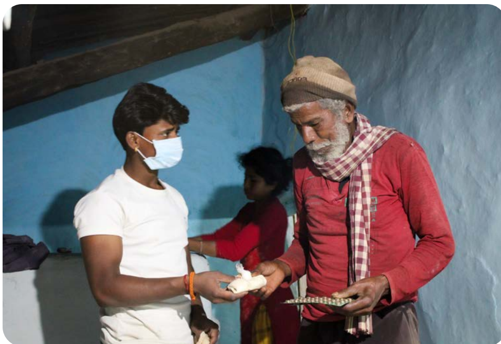
Our bare-foot health volunteer handing over medicines and nutrition supplements to a TB patient in Madaiyan village

families, considering the recurrence of the illness and repeated courses they took and have become drug resistant to.