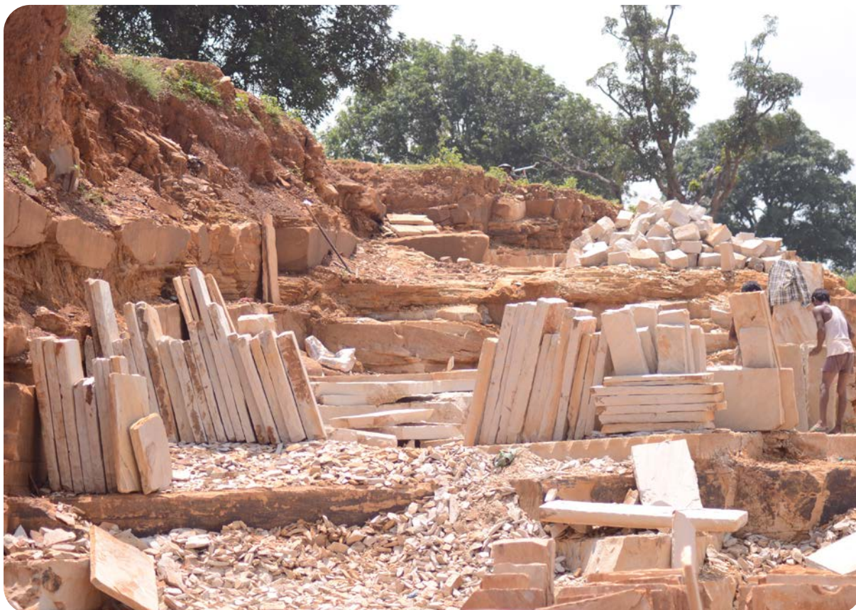
A stone mine in Panna

icies which include a penalty to be paid by the department to the victims and their families for delays in reimbursements, payment after death of workers in order to strengthen accountability and humanitarian outreach from state institutions.