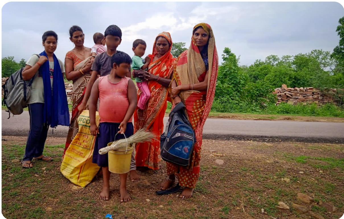
A family migrating from Panna for work

and media. Hirapur, Janwar, Madla, Nayi Basti, Kaneri, Talgav, Pithmapur, Modaikhara, are relocated colonies who lost all their land to the PTR and were forced to resettle in/near non-tribal villages with neither land nor forest resources accessible to them. Umra- van, Kemashan, Bador, Darera are some of the villages where the Gonds had to give up