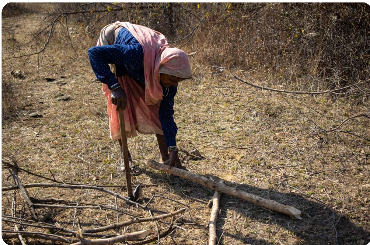
An elderly caregiver collecting firewood near Umraivan

come much more strenuous and hazardous as the PTR restrictions and increase in tiger population pose physical risks, longer hours of walking far to fetch firewood and other resources, while also facing the harassment of forest guards. Where the families submitted to relocation, their condition is worse as access to forest for food, incomes or utility items has come under severe stress. Their original source of wild food that provided some nutrition and herbal remedies are no longer available.