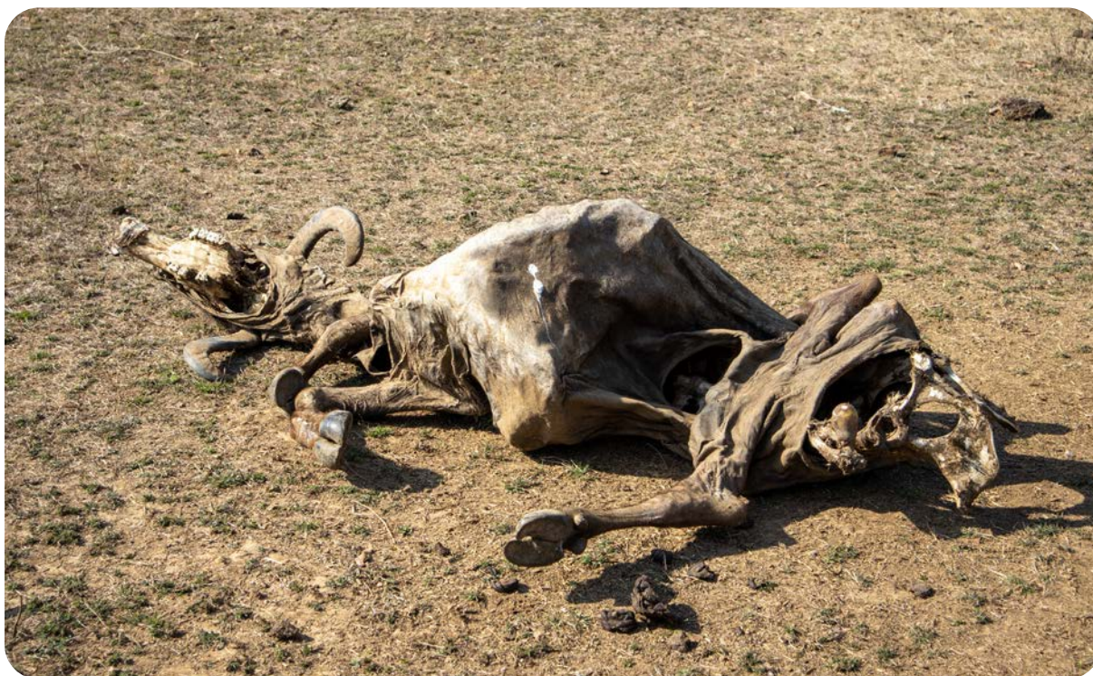
The decaying carcass of a cow killed by wild animals near Umraavan village, Panna

and other information are disclosed. If implemented, they are redirected to general purpose expenditures within the district while areas where environmental damages directly induced by mining and local communities suffering from multiple impacts, remain unredressed. This defeats the purpose of mine area restoration and mining affected communities' rehabilitation. Despite Panna having several small mines (licensed and unlicensed) and the country's largest diamond producing mine next to which the villages covered in this report are located, the Gonds remain malnourished, poor and suffering from ill health and lack of livelihood opportunities. The area holds vast potential for several regenerative and just transition activities by linking the DMF funds with other social security schemes like the MGNREGS (particularly as negligible numbers of Gonds have been able to access it) where employment guarantee could reduce seasonal migration and starvation. The Silicosis rehabilitation welfare schemes should be linked to the DMF funds so that affected families get