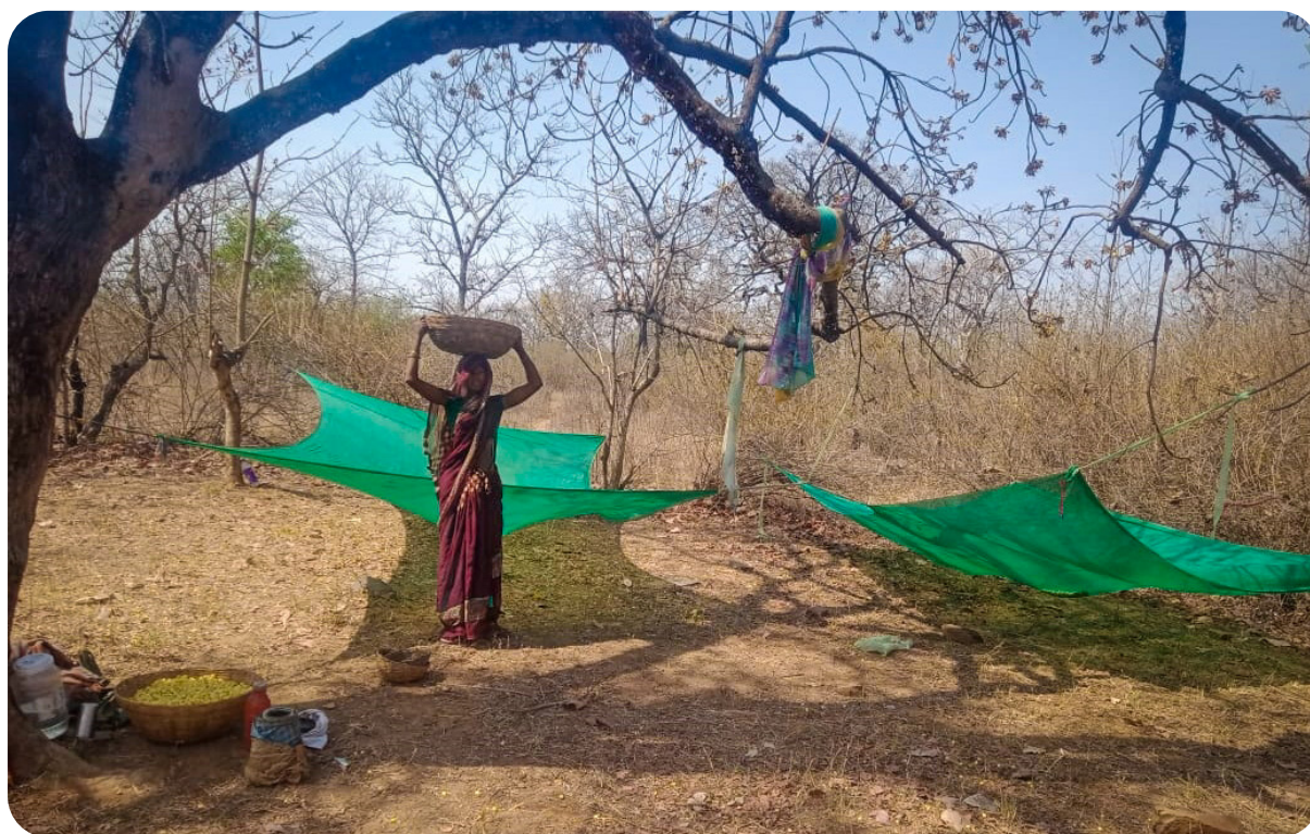
A woman collecting Mahua in Panna

none have been given jobs. There is a long history of working in the stone and diamond mines for the Gonds in Umraavan (mostly reported as not knowing who the owners were and not having any worker registration cards). Among those who left and those who remained, a considerable number of men were afflicted with suspected Silicosis and Tuberculosis. A few were under the DOTS treatment process, yet had to leave abruptly and discontinue or erratically undergo their treatment, with little effect, as seen from the case histories of patients we profiled. Those who remained in the village refrained from utilising the compensation money until the time of Covid when they faced severe distress. Hounded by money lenders, hunger and Silico-Tuberculosis related health problems, resulted in the compensation money being spent on health emergencies and payment of debts to money lenders. Women, children and male members, all suffer from malnutrition and hunger, from the description of health problems shared by them. As of January 2023, identified and diagnosed