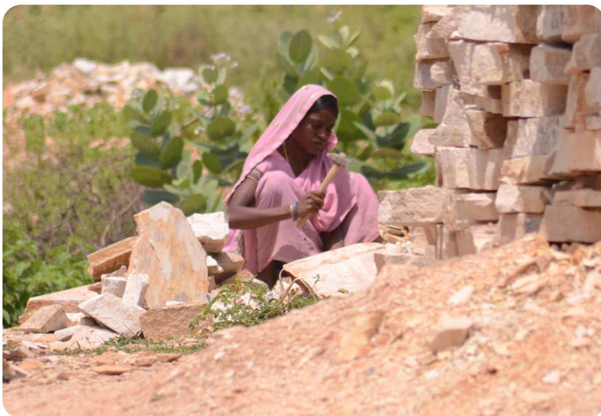
A woman worker at a stone mine in Panna