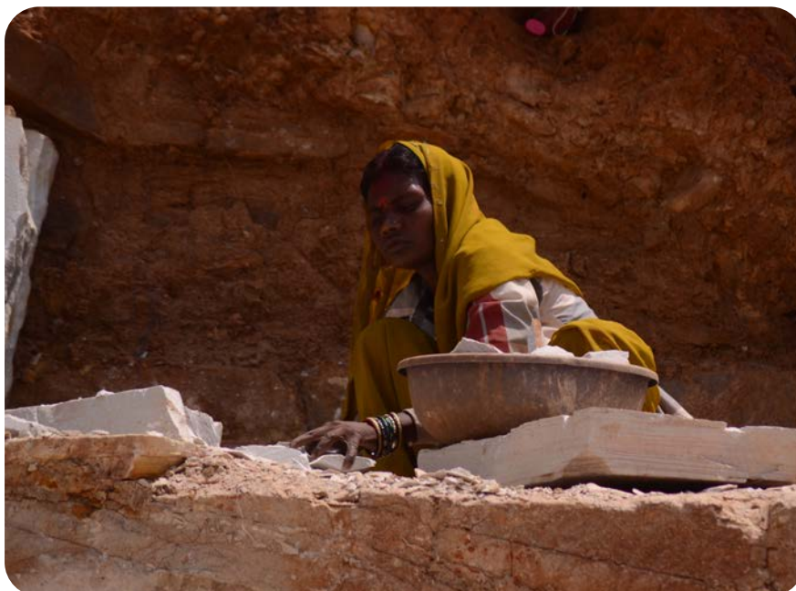
A woman worker at a stone mine in Panna

The stories that we present in the next section are firsthand narratives of women’s ground realities, which stand as examples of all the above analysis and findings.