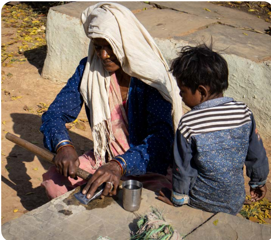
An elderly caregiver sharpening her axe as her grandson looks on