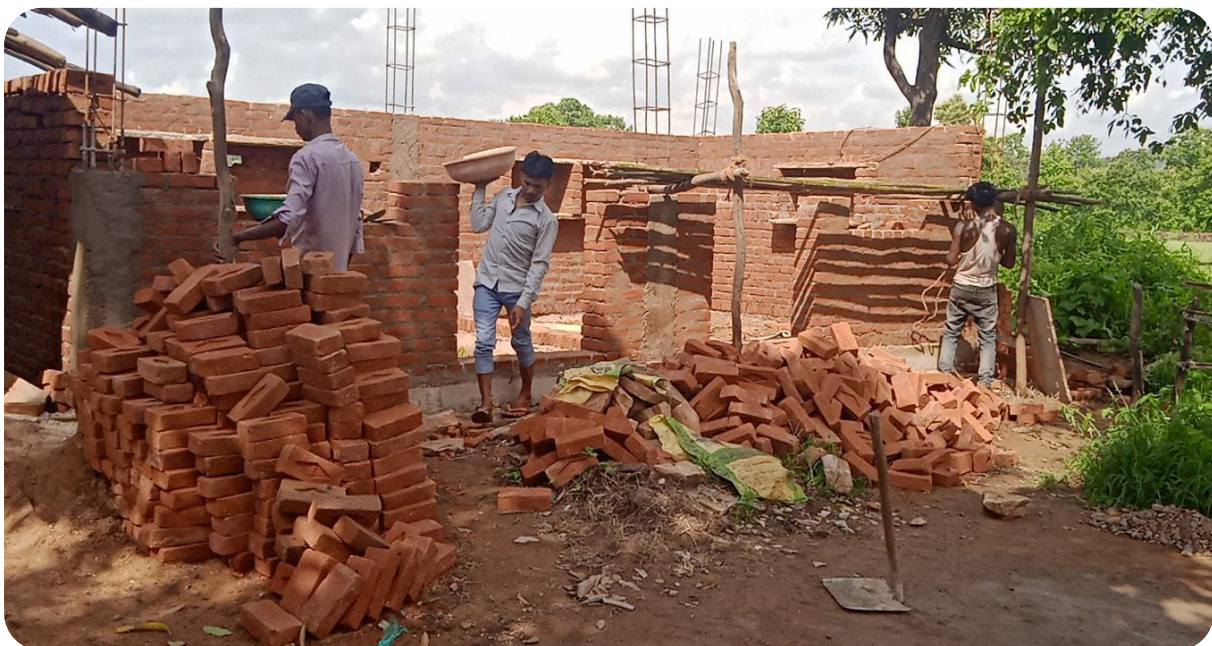
Men engaged in construction labour in Panna

A study from one district in the mountainous border state of Arunachal Pradesh revealed significant variation in the prevalence of use of alcohol and tobacco based on specific tribe membership, in addition to other variables including ethnicity, altitude of residence, occupation, and religion (Chaturvedi and Mahanta, 2004) In addition, other aspects like literacy, socioeconomic status, socio-cultural/mythological beliefs on health, roles of traditional healers in the community, social stigma and gender based discrimination indirectly affect health outcomes in general, and TB infection and transmission, in particular. Several social/personal behaviours the com-