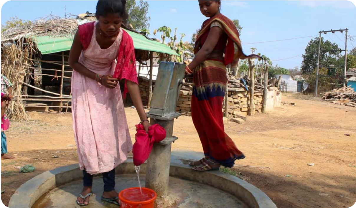
Women using cloth to filter water from the handpump in Kaimasan village

Gond, Sor Gond and Sonkars (SC). The upper castes from Bador village, they claim, cause violent disputes and prevent the Gonds from accessing their own lands or even putting up claims under the FRA. The village is located very close to the NMDC diamond mines and suffers from water pollution and biodiversity loss like drying up of streams, talaabs (tanks), extinction of fish species and herbal medicines that were their source of nutrition, death of cattle from drinking polluted water or being killed by wildlife attacks. This village particularly faces a constant threat of wildlife attacks with every family having lost their cattle, and with no compensation received. No family has any hens, goats or cows any more which were earlier their source of nutrition and income from sale of dairy products. They say that the drinking water pollution is severe due to diamond mining with the two hand pumps that are the only source of water, spewing contaminated water. So women have to find other means of cleaning the water or walk longer distances to other sources, adding to the burden of their workload. The ASHA worker herself is directly affected