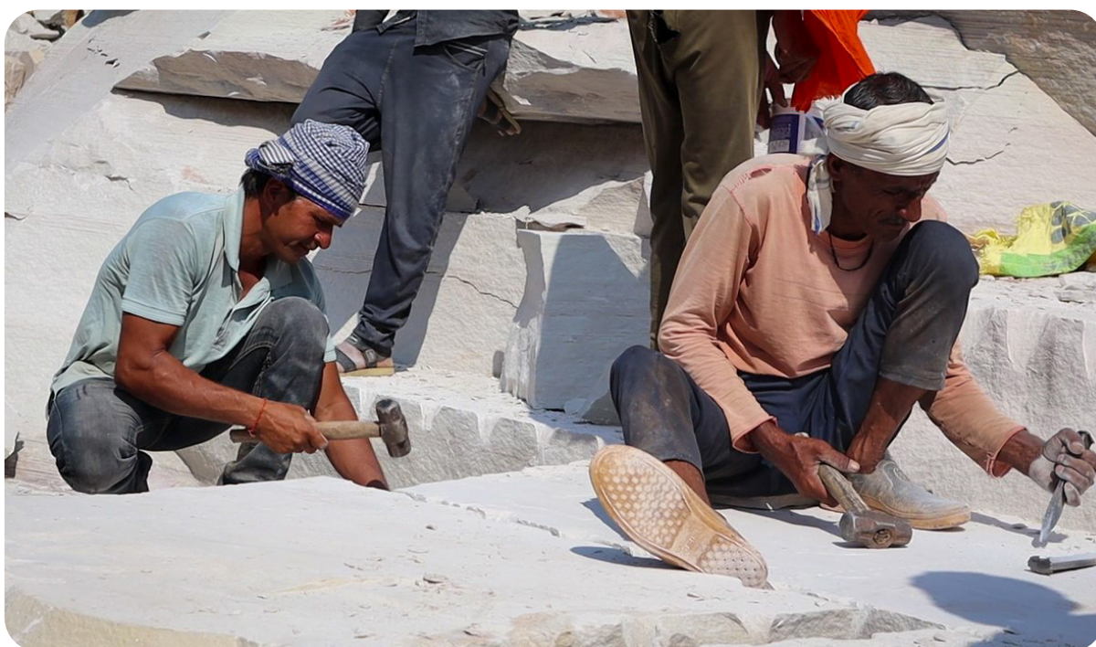
Workers at a stone mine in Panna district

These diseases are very closely associated with each other and can be easily misdiagnosed or wrongfully treated, causing greater harm and suffering to the patients, if adequate resources are not employed in the