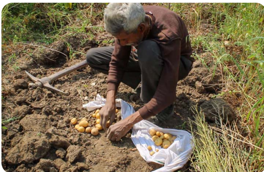
A TB patient works in his field in Madaiyan village

The conservation model in Panna, as elsewhere, has caused great suffering to the Gonds while compromising on diversion of forest lands for other non-forestry commercial and development projects. New forms of restrictions like fortress plantations under climate action programmes are further restricting the entry of tribals for their basic food, firewood, NTFP and further causing distress to caregivers and patients. The loss of cattle to wildlife attacks has become a huge burden on these families already staggering under debts for health expenses. Community inclusive and conservation methods of eco-systems protection and regeneration without further diverting forest lands for non-forest purposes would be a more sustainable form of promoting the co-existence of tribals who have traditional nature based conservation practices and in allowing wildlife to have sufficient corridor space for their movements.