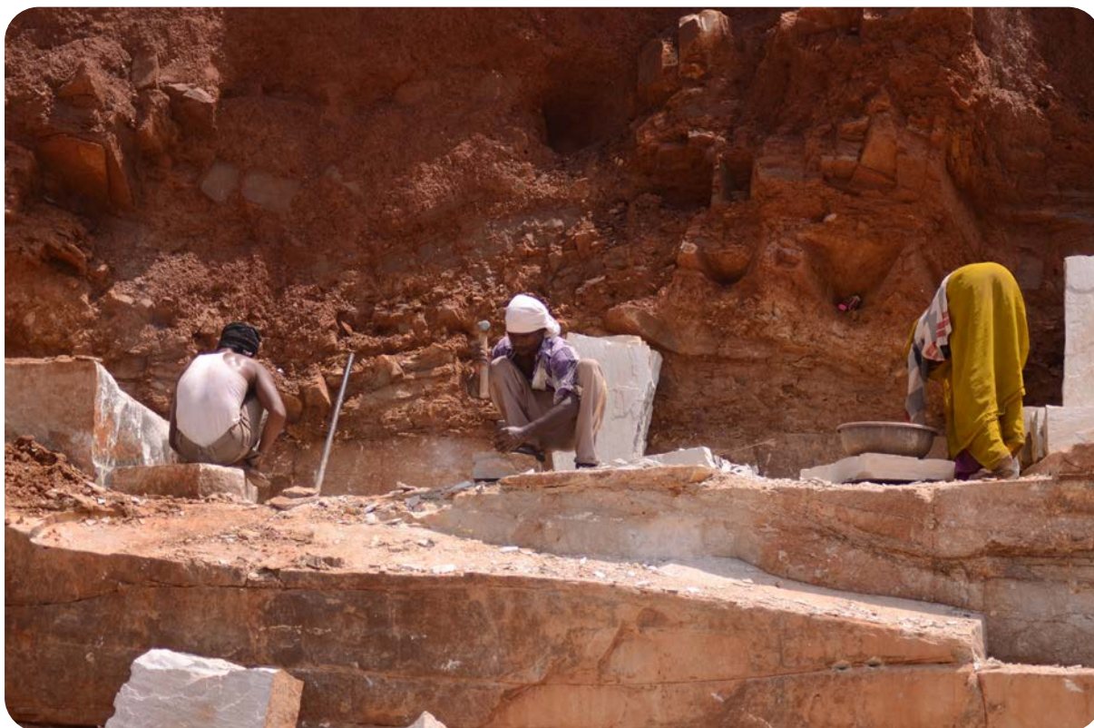
Workers at a stone mine near Panna

Silicosis cases. A clear correlation emerges between the number of years worked in the mine and the severity of the cases.