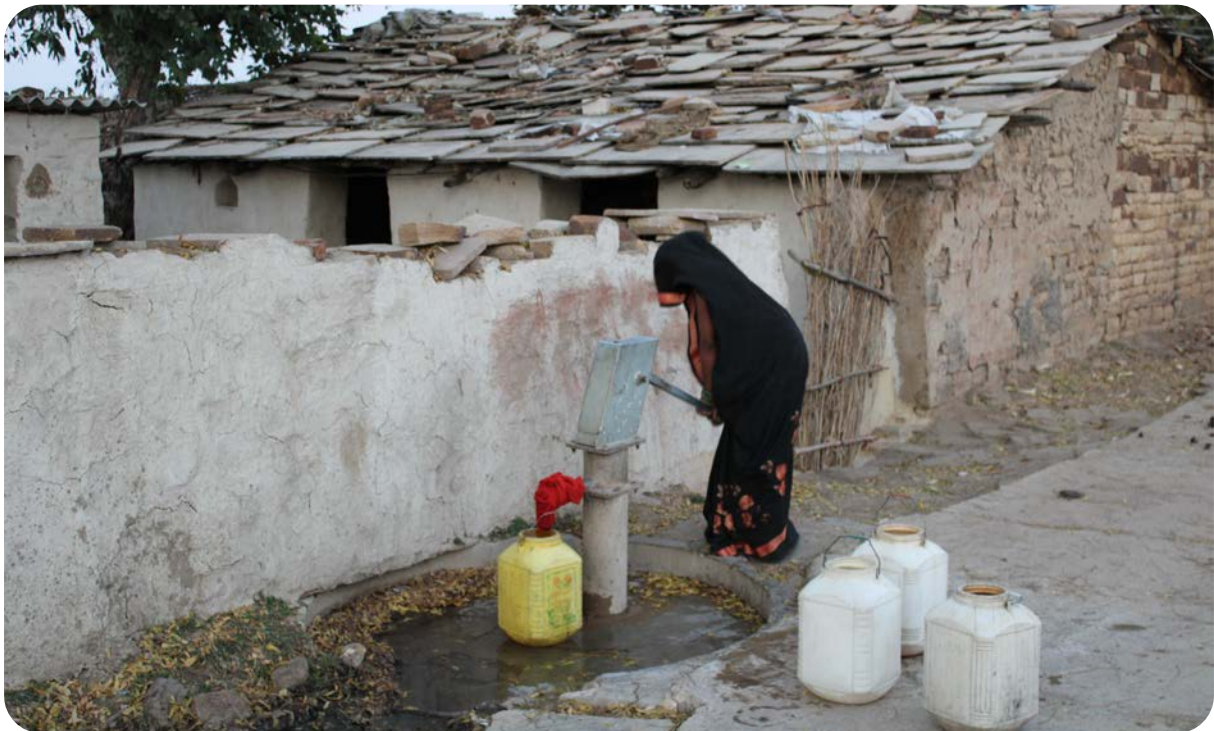
A woman drawing water from a handpump in Umravan village

structural levels. Climate finance and Just Transition frameworks need to be assessed from the dimension of entitlements in order to understand whether alternatives or conservation/afforestation programmes are inclusive of communities and their food security. Periodic Gender Audits of these programmes have to be built into these programmes through inclusion of affected women.