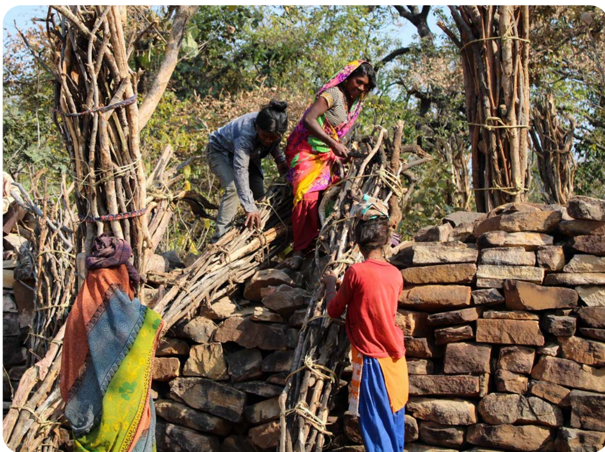
Women returning after collecting firewood from the forest

families are awaiting settlement of claims. Only 11 Gond families have revenue land and they cultivate mustard, wheat, chickpeas and lentils. Only 3 villagers from the upper caste got employment with NMDC, but not the Gonds. The Gonds are exploited by the upper caste on several matters including corruption in wages from MGNREGA, as complained by the tribals. There is a history of mine labour among the Gonds who have worked for many years in the stone quarries. There are stone quarries present in Bador itself, although officially they are closed and Gonds are hired as mine labour now and then, by local contractors. They also go to Shahnagar and other places in M.P for similar stone breaking work. Almost every tribal family goes out for migration seasonally to Surat, Chhattisgarh, Jaipur, Maharashtra, Sagar, Gurgaon, Bhopal, Indore, Nagpur, Jhansi, Haridwar and other places for construction work, brick kilns, restaurants and small shops and other petty