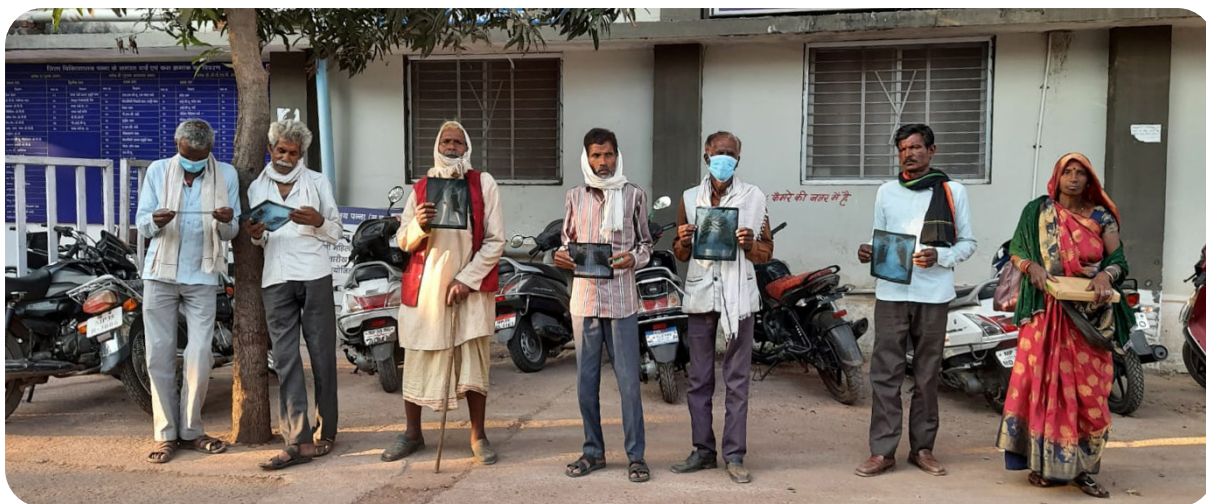
Our team assists patients to get their timely check-ups like blood tests and scans at the PHC

relocation for the PTR left them with huge gaps in getting these entitlements in their new colonies, even after 15 years of relocation. Coming to compensation and pension schemes, only 4 households said that they received the Rs.500 pension for six months after the TB diagnosis and none for Silicosis as the Madhya Pradesh government does not, till date, have a Silicosis prevention or rehabilitation policy.