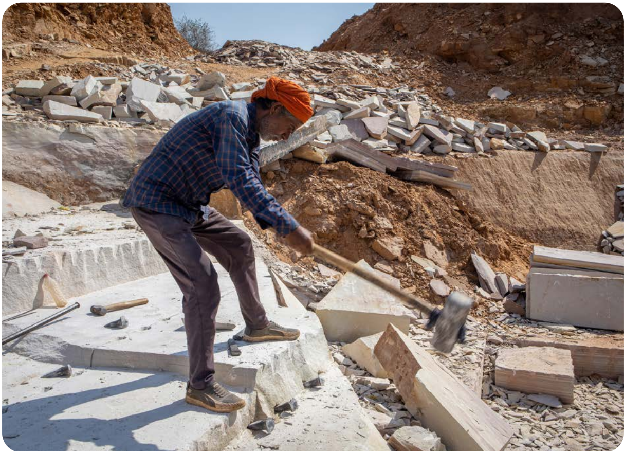
A worker breaks stones at a mine in Panna district

A person is predicted to have Silicosis when it cannot be treated even after completion of TB therapy. After the initial 1–2 months of intensive anti-TB treatment, patients return to dusty work conditions, increasing their exposure to silica dust even further, and the vicious cycle continues, causing them to develop TB again along with having Silicosis. Because exposure to silica dust makes peo-