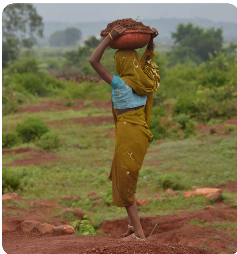
A woman worker at a diamond mine in Panna