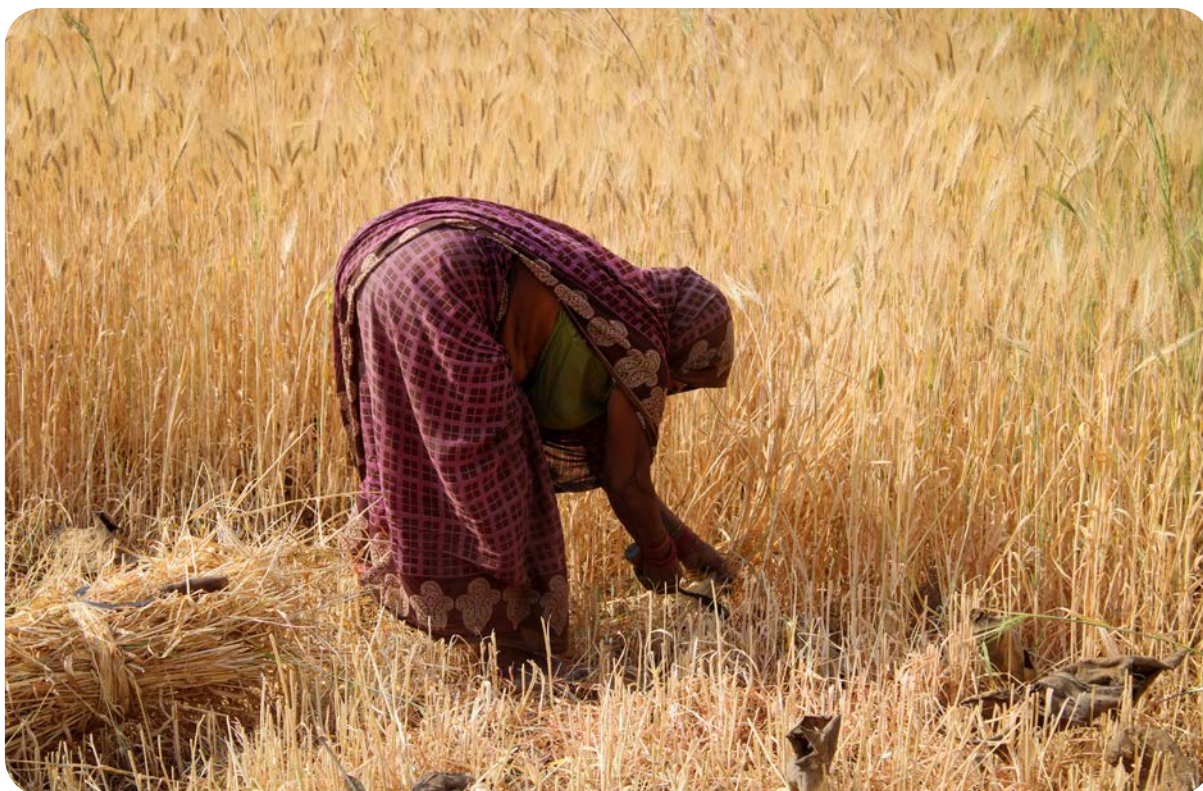
A widowed woman working in a wheat field in Madaiyan village

TB patients are 5 in number and these could be suspected Silicosis as well. Repeated use of the DOTS course and failure of the same has driven the Adivasis into the hands of the private health practitioners and quacks, resulting in most of their earnings going into medical expenditure. The BHV identified two children aged 6 years (boy) and 8 years (girl) as suffering from TB, having contracted it from the father. They received the DOTS medication and are now successfully treated. Recently, with the help of the BHVs, one female got diagnosed for TB and is receiving treatment under DOTS. She has also started receiving Rs.500 for supplementary nutrition support, which many families had failed to get. Almost every family has debts related to health expenses. Of the 13 families, 5 are widow-headed, whose distress situation led to their children dropping out of school.