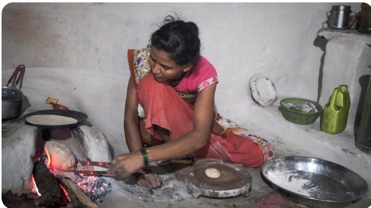
A woman cooking on a firewood stove

greater physical suffering to the victims due to toxic gases from cheaper qualities of firewood they have to depend on today, thereby aggravating the health crisis in addition to additional work loads and safety concerns.