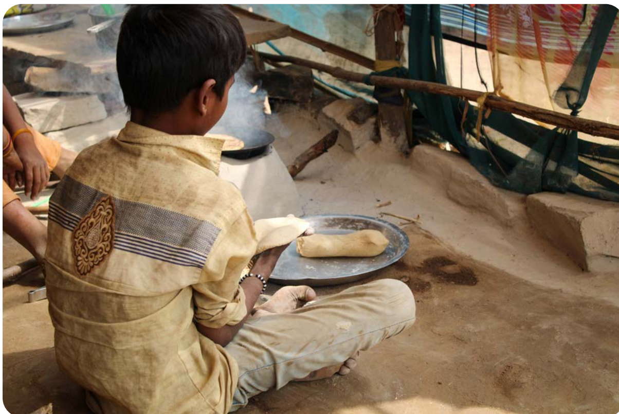
A child in Bador helping his mother in the kitchen. He could not get enrolled in school as he does not have an Aadhaar card.