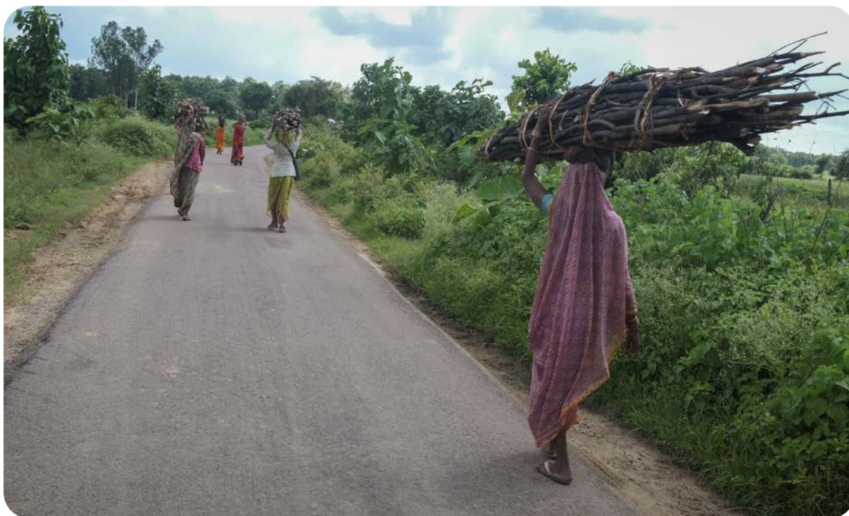
Women returning after collecting firewood

This has added to the burden of housework to the caregivers. While distancing them from the use of firewood has become an objective of most climate action programmes (including the Green India Mission and Ecosystems Services project financed by the World Bank in Panna district itself), these alternate solutions have been too scattered and ineffective to make any sustainable change to women's cooking needs. Rather, they have become a violation of women's rights despite climate funds being stated to have gender policies and operational guidelines for protection of indigenous peoples. None of the Gond women in the study villages received any alternate cooking devices. Instead, women have been criminalised, adding to their hours of work and mental trauma. Effective use of the DMF funds to create locally sustainable alternatives whether renewables or clean technologies would save these mining af-