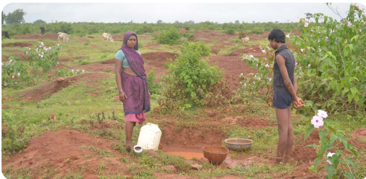
Workers at a diamond mine in Panna district

There are several challenges to accessing the entitlements offered in each of the state policies while some of the states like Madhya Pradesh which has a high prevalence of both TB and Silicosis have not even formulated their Silicosis prevention and rehabilitation policy, leaving behind large numbers of affected workers and their families in deep financial crisis and physical suffering. In India, 80% of health care is provided by the private sector, but in rural parts, health care is provided by unqualified medical practitioners who do not have knowledge of occupational health. Hence people prefer to go to private hospitals which puts them in financial debt. In almost all the states, as reported by Occupational Health and Safety Association, Jharkhand, the Silicosis affected are working or have worked as informal labour with very poor regulation by authorities across different categories of hazardous industries and shifting the blame between different actors has left thousands of workers suffering without relief either on improving work safety standards or in rehabilitating affected workers and their families. In Rajasthan where monetary relief is provided to workers, the onus is on workers to get a diagnosis and prove their occupational history, which is challenging in an unregulated industry like