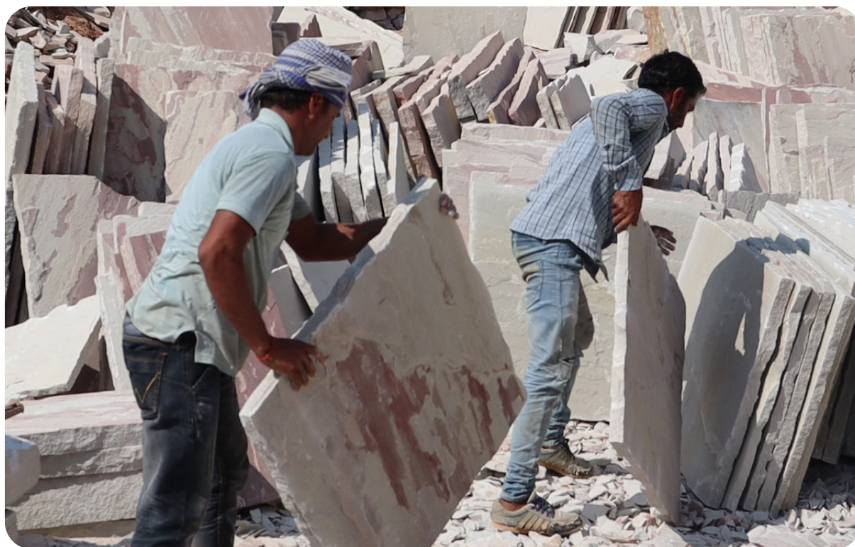
Men moving slabs of stone at a mine in Panna

range from a perceived need to hide symptoms or possible illness due to stigma, prioritising household and caretaking responsibilities, constrained decision making power, lack of mobility, and limited autonomy over financial resources”. The lower diagnosis of cases among women could also be due to the reporting of fewer cases of TB among women due to various other reasons including poor access to healthcare services, poor diagnosis and poor reporting of cases among women (Uplekar et al., 2001). It may also be due to physiological reasons. There is evidence to show that the presentation of pulmonary TB among women may be somewhat different from men, contributing to delays and making it difficult to diagnose TB in women. While men generally present symptoms of fever, haemoptysis and night sweats, women could present common symptoms or non-specific findings such as fever, body ache, loss of appetite and fatigue (Long et al., 2002). The same study indicates that more men report microbiologically confirmed pulmonary TB