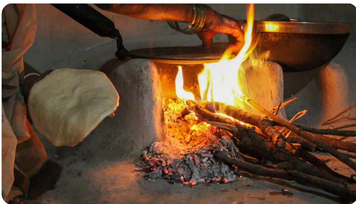
A woman making rotis (flat bread) on a firewood stove in Panna

which many changes happen in a woman's body, may experience the disease differently. Moreover, diagnosing TB disease in pregnant women becomes challenging due to common non-specific symptoms in both TB and Pregnancy." All of this can increase a woman's risk of contracting TB infection and the risk of pregnancy while they are still not cured from the disease. Tuberculosis infection in pregnant women can often be life-threatening and cause harm to both the mother and the child. There is enough evidence that pregnant women and women in the postpartum period face a higher risk of TB, one of the leading non-obstetric causes of maternal mortality in low-income countries like India. (Bates et al., 2015) These researchers underline that immunological changes during pregnancy make new infections as well as activation of latent infection more common among this group. The presence of TB disease during pregnancy, delivery, and postpartum is known to result in unfavourable outcomes for both mothers and their infants. These outcomes include a roughly two-fold increased risk of preterm birth, low birth weight, intrauterine growth restriction, and a six-fold increase in