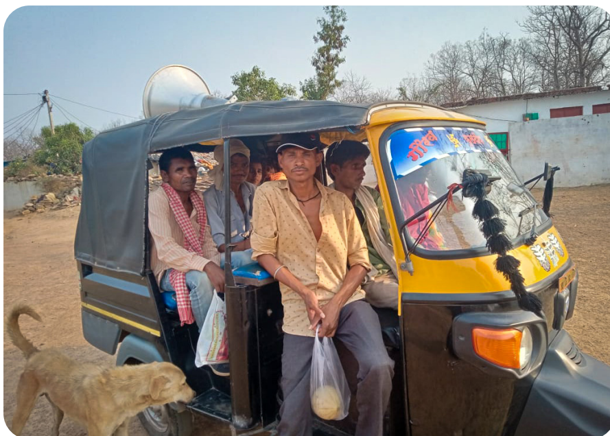
TB patients from Kaimasan travel to the PHC in an autorickshaw

up of Tribal Health and Wellness Centres at the community level (with a population coverage of 3000) in pockets of over 50% tribal population; mobile outreach services in difficult to access regions that are far from PHCs, setting up of additional PHCs and sub centres, specialist doctors to be appointed in tribal areas and other medical and social resources. Although the report on HWCs by the Ministry of Health and Family Welfare indicates that these systems are in place, the actual functioning is far from accessible to the last mile patients and caregivers in tribal areas. The current training and remuneration for ASHA workers is not adequate enough to motivate them in the discharge of their responsibilities. Sputum collection facilities, facilities for symptomatic care of Silicosis patients at community level, travel allowance for PHC visits for check-up for patients and caregivers, post treatment care and support to prevent relapse and provide lifelong palliative care for Silicosis affected are some of the public health support measures for responsible governance.