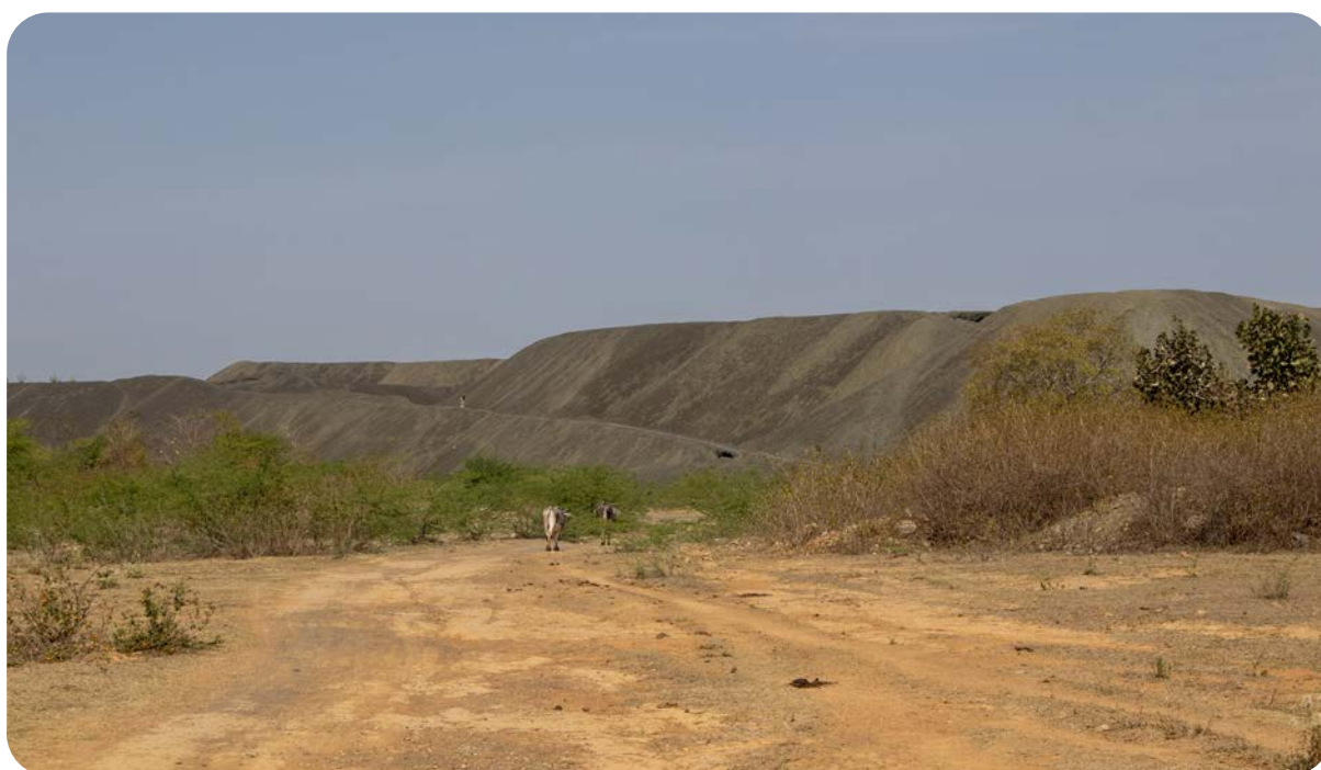
Tailings dam near the diamond mine in Panna

PTR, the NMDC managed to get an extension during the Covid time in 2021, after an investigation by a Supreme Court appointed committee laid out conditions for its operation. The mine is located in the core area of the Panna Tiger Reserve and a whole industry of small-scale diamond and stone mining operations boomed in this forest. The Gond Adivasis living here became victims of the mines as well as of the tiger reserve when entry into the forest and farming in their lands became prohibited. Most families ended up being more dependent on the informal mines, both diamond and stone quarries. The direct